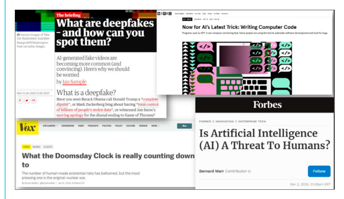
Figure 3. Media amplification of AI Doomsday fears

to pervasive fears, the reality we've discerned suggests a future where human researchers and LLMs can coexist and contribute complementarily to the field of qualitative research.